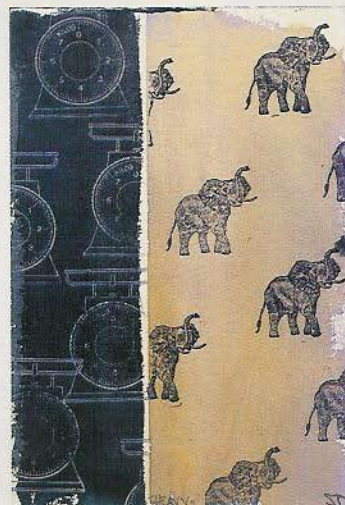
Untitled (2007) watercolor, rubber stamp ink on paper, 29cm x 19cm

The resulting exhibition is more than paintings in a gallery; it is an event that is the catalyst for how those paintings came to be, the dynamics of making art in the moment.