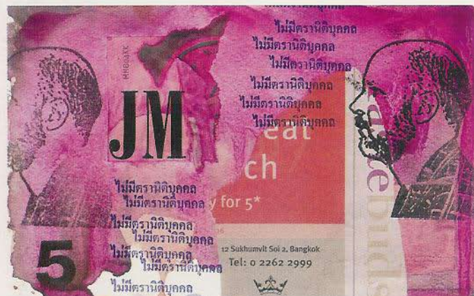
Untitled (2006) watercolor, press type, rubber stamp ink, torn papers on paper, 13cm x 20cm