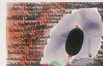
Untitled (2006) watercolor, rubber stamp ink, vinyl letter on paper, 13cm x 20cm

Teo + Namfah Gallery, an international contemporary art gallery, shows the latest developments in contemporary art, both from Thailand and abroad.