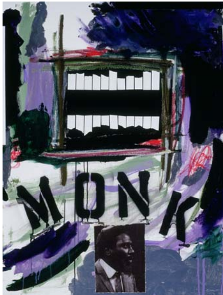
Monster Piano [Thelonious Monk] (2001), mixed media on canvas, 30" x 40", from the series "Angels of Jazz"