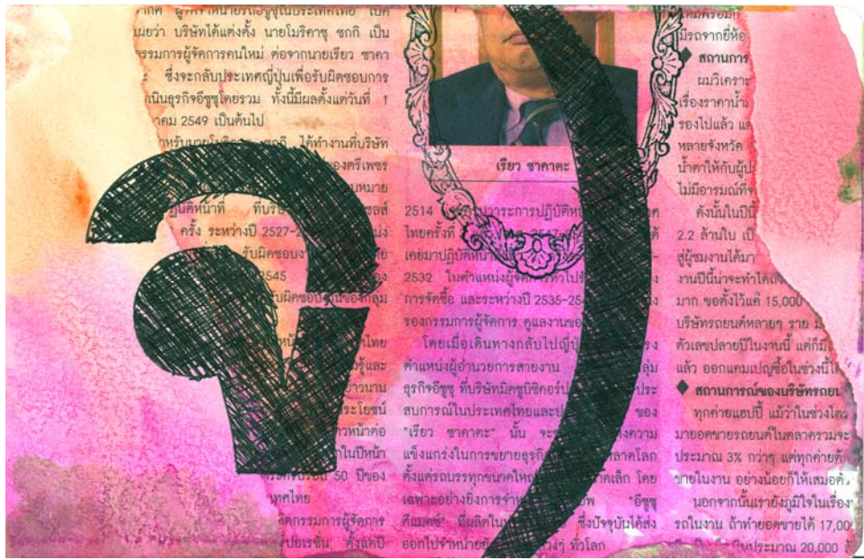
untitled — on page 40 in the catalogue (2006), watercolor, ink, torn newspaper on archival watercolor paper, 5” x 8” from the series “Lifestyle Art Project: Thailand”