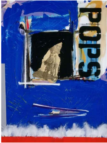
Every Day is Mardi Gras [Louis "Pops" Armstrong] (2001), mixed media on canvas, 30" x 40", from the series "Angels of Jazz"