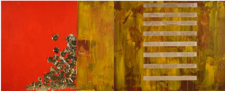
Wat (2006) mixed media on canvas, diptych 200cm x 80cm from the series "Lifestyle Art Project: Thailand"

Thailand offers a bounty of new colors and forms for Perkins to incorporate into his signature collages. The palette is much warmer, and the icons of the region include elephants and Buddhas. Perkins also tantalizes us with characters from the Thai alphabet, elegant lines and curves that are so pregnant with the potential for meaning.