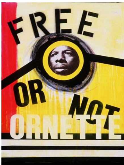
Free, or Not [Ornette Coleman](2004), mixed media on canvas, 30" x 40", from the series "Angels of Jazz"